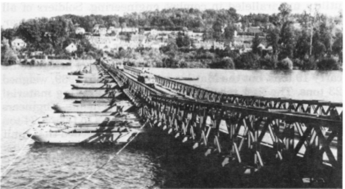
British floating Bailey bridge on Mark VI pontoons.

The engineers decided that in designing and producing a new bridge they had the opportunity to correct many of the problems which had plagued similar projects in the past. To this end, they developed a set of criteria for the new bridge. First, the girder and deck system had to be capable of being strengthened at will and in place. This would allow flexibility in handling various vehicles. Second, all parts had to be made of readily available materials. Special steels were sometimes impossible to acquire during the war. Third, any engineering firm had to be capable of building the bridge. In the past some of the designs were so complex that only a few companies were able to produce the material. Similarly, close manufacturing tolerances would be avoided if possible. This would also simplify production by a variety of companies.