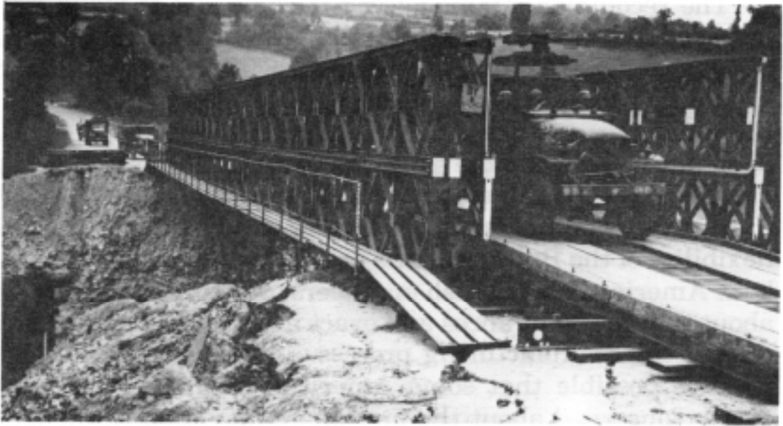
Traffic crossing a class 70 panelbridge with a pedestrian walk.

the Bailey primarily as a fixed bridge replacement for the H-10 and H-20 bridges. Later, the board was to test both the Bailey and the H-10 bridge on the 25-ton pontons. The fixed bridge test took place at Fort Belvoir with the float bridge test scheduled for the Yuma Test Branch in the Southwest. The Engineer Bridge Branch submitted its fixed bridge test results on 5 December 1942.