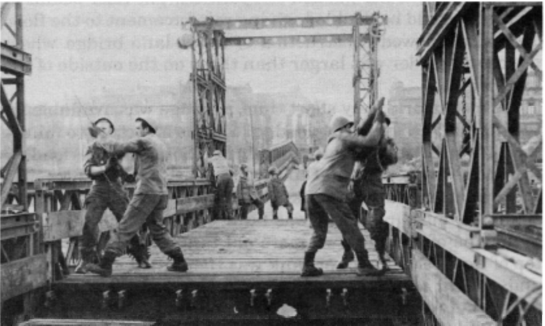
Engineers lift the bascule span of a class 70 Bailey bridge.

The American side of the Bailey bridge story began in May 1940 when the U.S. Army's Ordnance Department announced that the existing 15-ton medium tank was obsolete. Ordnance plans called for a newer medium tank of 25 tons and a heavy tank of 50 to 60 tons. Like the British, the American engineers' first response was to modify existing