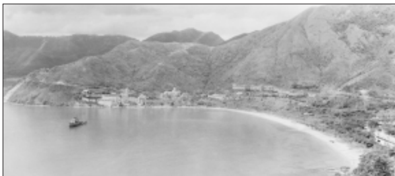
THE REPULSE BAY HOTEL, WHERE THE ROYAL RIFLES FOUGHT FROM DECEMBER 20 TO 22, 1941.

military deterrent against the Japanese, and reassure Chinese leader Chiang Kai Shek that Britain was genuinely interested in defending the colony. Canada was asked to provide one or two battalions for that purpose.