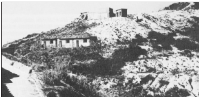
THIS ROAD LEADS OFF THE STANLEY GAP ROAD UP TO JARDINE'S LOOKOUT.

The Japanese attack did not take the garrison by complete surprise; the defence forces were prepared. On the morning of December 7, the entire garrison was ordered to war stations. The Canadian force was ferried across from Kowloon to the island, and by 5 p.m. the battalions were in position and Brigadier Lawson's headquarters was set up at Wong Nei Chong Gap in the middle of the island. Fifteen hours before the Japanese attacked, all Hong Kong defence forces were in position.