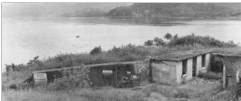
LYE MUN PASSAGE BATTERY.

Hong Kong also lacked adequate naval defence. All major naval vessels had been withdrawn, and only one destroyer, HMS Thracian , several gunboats and a flotilla of motor torpedo boats remained.