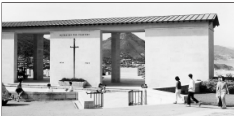
SAI WAN BAY MEMORIAL.

First, they attempted a thrust along the shore of Repulse Bay in the hope of reaching Wong Nei Chong Gap - and the West Brigade. They managed to drive the enemy out of an area around the Repulse Bay Hotel. However, they were unable to dislodge the Japanese from the surrounding hill positions and were forced to withdraw. One company of the Royal Rifles was left to hold this area and a renewed effort to break through was made on December 21. Next came an attempt to reach Won Nei Chong by a more easterly route. Despite heavy enemy opposition south of Tai Tam Tuk Reservoir, the Royal Rifles succeeded in driving the Japanese out of a number of hill positions and in destroying a group holding the crossroads south of the reservoir.