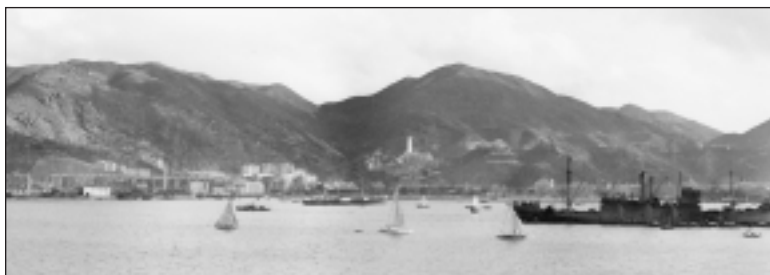
VIEW OF EASTERN HONG KONG FROM HMCS PRINCE ROBERT , NOVEMBER 19, 1941.

The defence of Hong Kong was made at a great human cost. Approximately 290 Canadian soldiers were killed in battle and, while in captivity, approximately 267 more died as POWs, for a total death toll of 557. In addition, almost 500 Canadians were wounded. Of the 1,975 Canadians who went to Hong Kong, more than 1,050 were either killed or wounded. This was a casualty rate of more than 50%, arguably one of the highest casualty rates of any Canadian theatre of action in the Second World War.