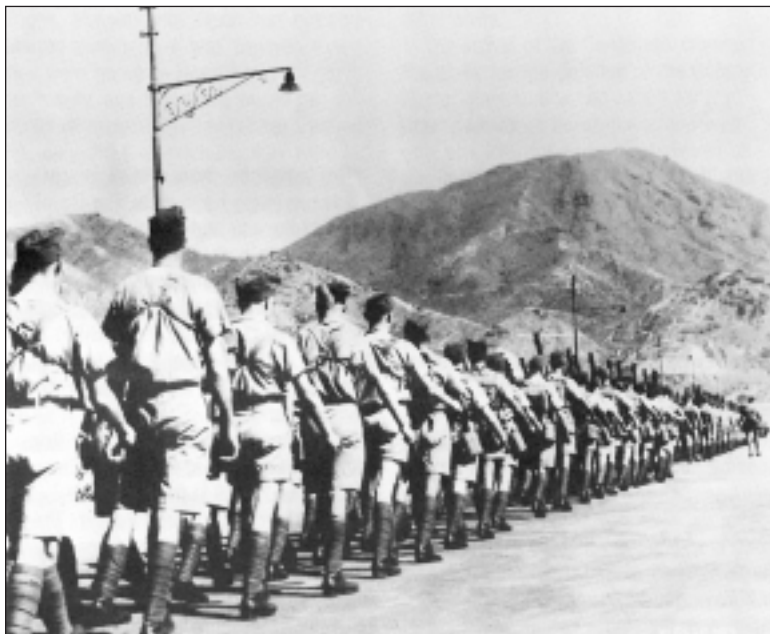
CANADIAN CONTINGENT IN HONG KONG, 1941.