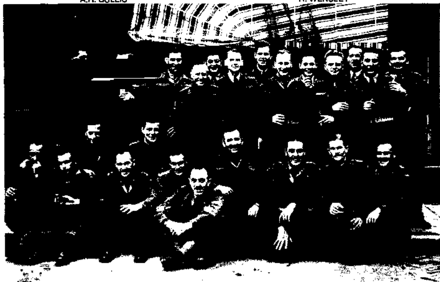
Reunion of Officers - 21st Field Regiment June 1945 - Apeldoorn, Holland